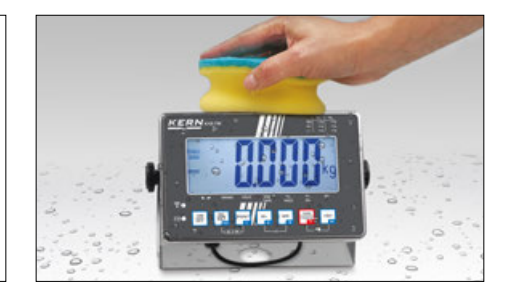
Thanks to the stainless steel design of the evaluation unit and platform with smooth surface – the scale is rust-free and easy to clean